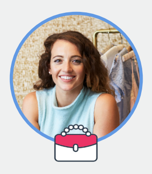
Fashion & Apparel