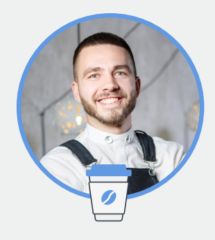
Quick Serve Restaurants