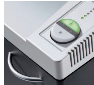
Some models are equipped with an LED Shred Efficiency Indicator to monitor shredding and help prevent jams.

Don't buy a shredder based merely on specifications. For example, horsepower is frequently used to compare shredders, but it isn't all that meaningful. Likewise, shredders may have been tested using lighter-weight paper than what's used in your office. The real test is shredding your paper in your office.