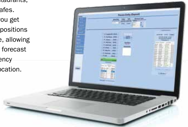
Cash Logistics Manager interfaces to your cash and coin processing equipment to eliminate error-prone manual entry, spreadsheets or out-of-date software.

Tracking cash flows of non-gaming operations can be difficult and inefficient unless you have the right software solution. CLM's tracking and real-time reporting capabilities work effectively with non-gaming banks, such as restaurants, retail tills, family games, and safes. Similar to gaming operations, you get reports of your current or past positions from each location or employee, allowing you to assess your operations, forecast intelligently, and view the efficiency and profitability of each cash location.